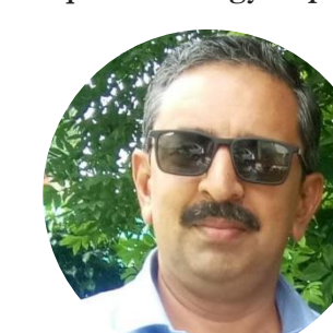
Ambarish Ghatate Aura Conservation Park Theme Based Garden / Medicinal Plants